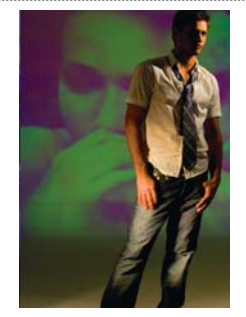
RIVET DE CRU