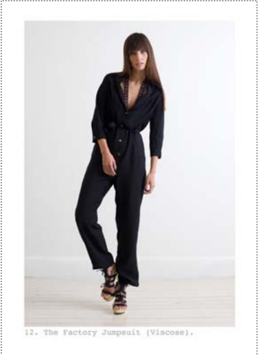
12. The Factory Jumpsuit (Viscose).